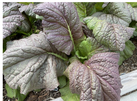
Red Giant mustard