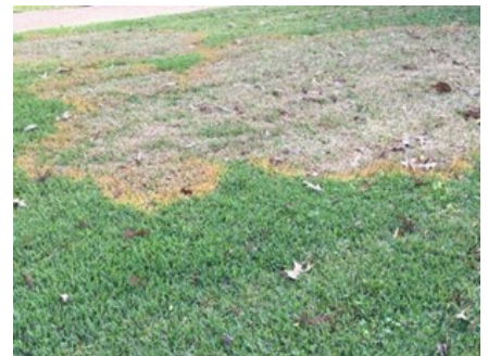
Large patch disease on St. Augustine. If you notice disease, do not add nitrogen.