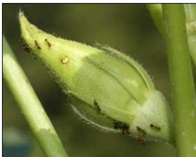
Fire ants can cause damage to okra blooms and pods

Some fire ant baits containing the active ingredient spinosad may be applied directly to the garden and are even approved for use by organic gardeners. Spinosad, permethrin, and carbaryl insecticides can be applied to problem mounds within the garden area by using the soil drench method. Mix and apply according to directions on the label. Use 1 to 2 gallons of drench per mound. Using the soil drench method with an approved vegetable insecticide and applying an approved fire ant bait in the areas surrounding the garden will help you get control of fire ants.