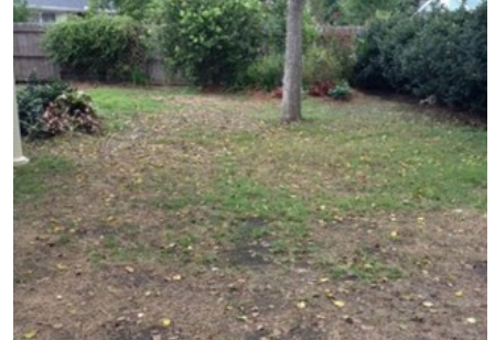
Centipede decline often occurs due to improper maintenance.

Lastly, we are getting close to the time of year when insect and disease pressure increases. If you see yellowing and/or browning in the lawn it could be either one but identifying it correctly is the only way to have success. If you suspect you may have either of these, please refrain from applying nitrogen until it's controlled: otherwise, it can increase the intensity. You can contact your local Extension office to help you identify the problem and provide the proper control methods.